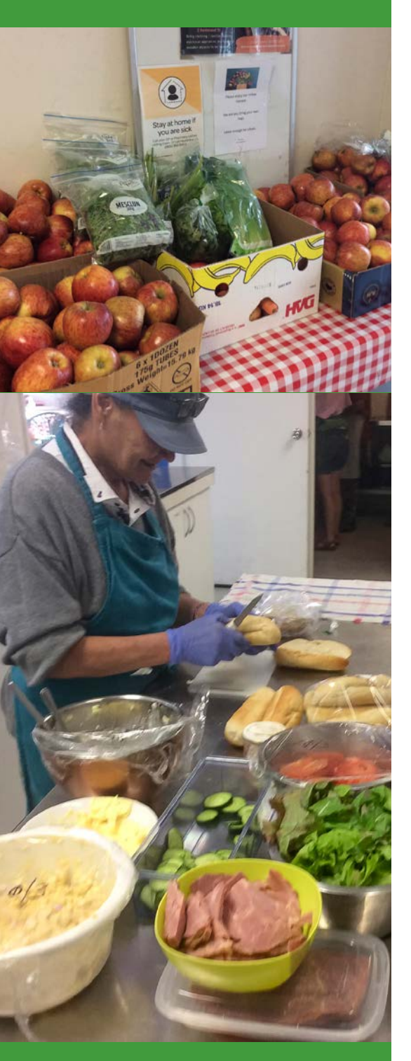
Crossroads Marlborough provides a community kitchen and café where everyone is welcome.